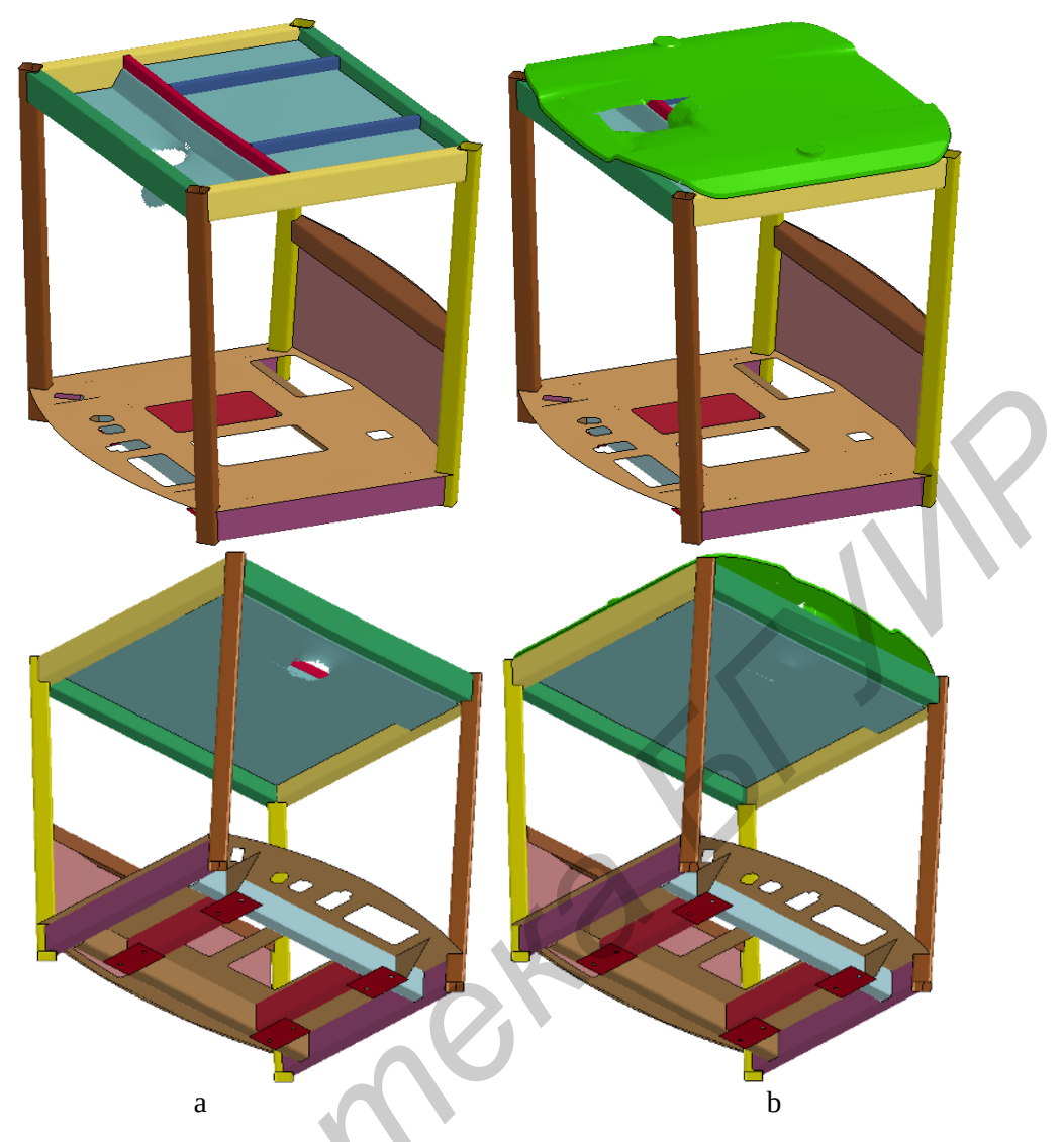
Figure 2 – Results of level II impact protection test, where a – traditional tractors FOPS, b – tractors FOPS with composite panel.