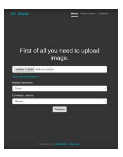
Figure 3. Image sound generation page.