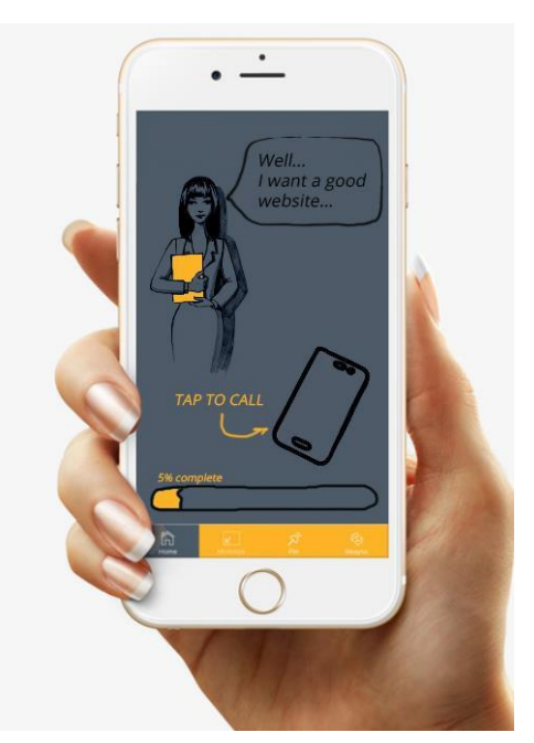
Pic. 2 Speaking level in dark mode on IOS device