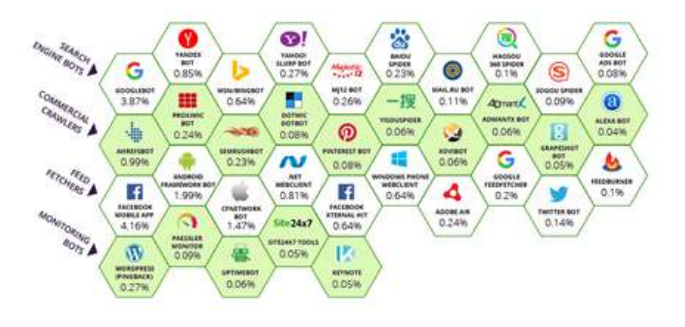
Figure 1. The four groups of good bots.

Imperva Research Labs saw the highest percentage of bad bot traffic (25.6%) since the inception of the report in 2014, while traffic from humans fell by 5.7%. More than 40% of all web traffic requests originated from a bot last year.