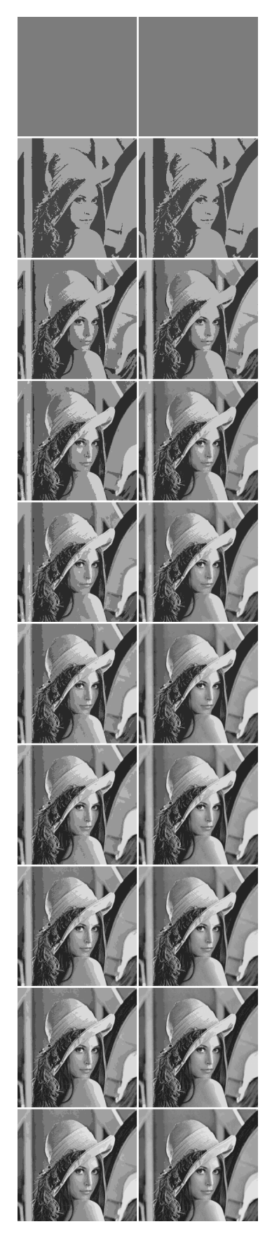
Fig. 2. Sequences of optimal (left) and superpixel (right) approximations of "Lena" image.

Pattern \ Recognition \ and \ Information \ Processing \ (PRIP'2021): Proceedings \ of the 15th \ International \ Conference, 21–24 \ Sept. 2021, \ Minsk, \ Belarus. - Minsk : UIIP \ NASB, 2021. - 246 \ p. - ISBN \ 978-985-7198-07-8.