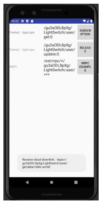
Fig. 5. The mobile phone received the message sent by the platform

On the Mqtt example page, after set the topic of the message to be published, clicked Publish, On the left navigation bar, selected Device Management > Device, found the device, and viewed the device status. If the device status was displayed as online, it means that the device is successfully connected to the IoT platform. In the navigation bar on the left, selected Monitoring Operation > Log Service, selected the night light switch product, and viewed the logs of the device going online, subscribed to topics, and reported messages as shown in Fig. 5.