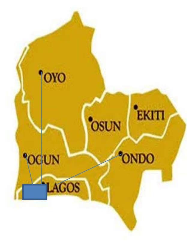
Figure 2 – Map of Western Nigeria showing the different locations of the enterprise

A basic diagram showing the locations of the enterprise in the Republic of Nigeria can be seen in the figure 2 below.